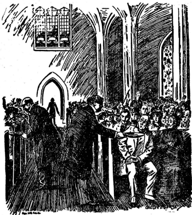
A MORE HONORABLE WAY

Again the money-changers are operating in the house of the Lord, and again seem appropriate the words of the Master: "It is written, My