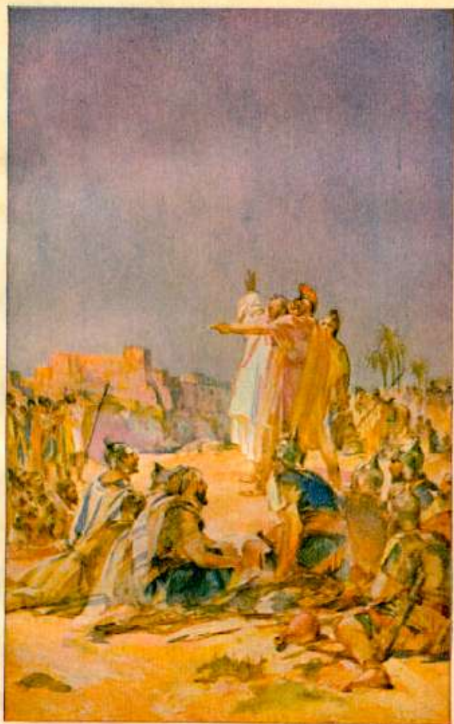
Covenant of Faithfulness Page 284