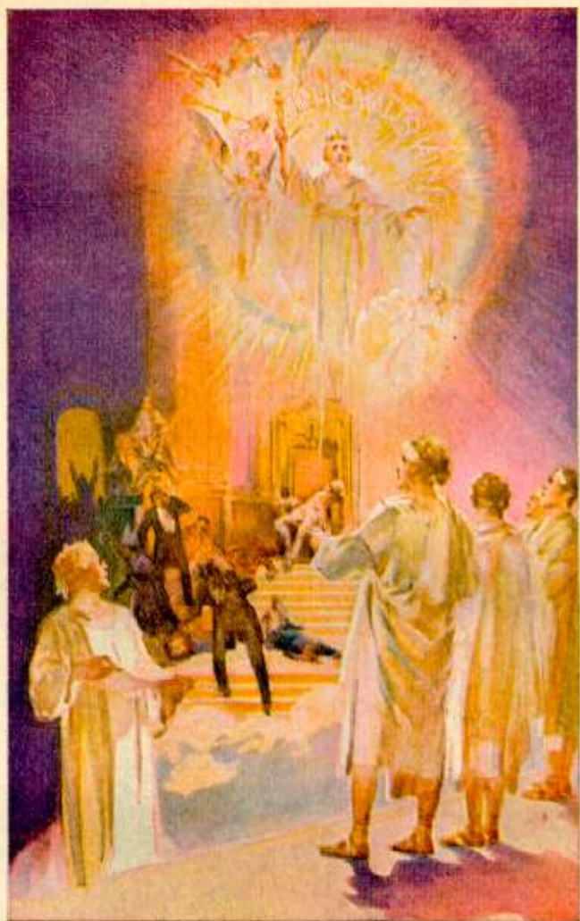
Restoring the Kingdom Page 345