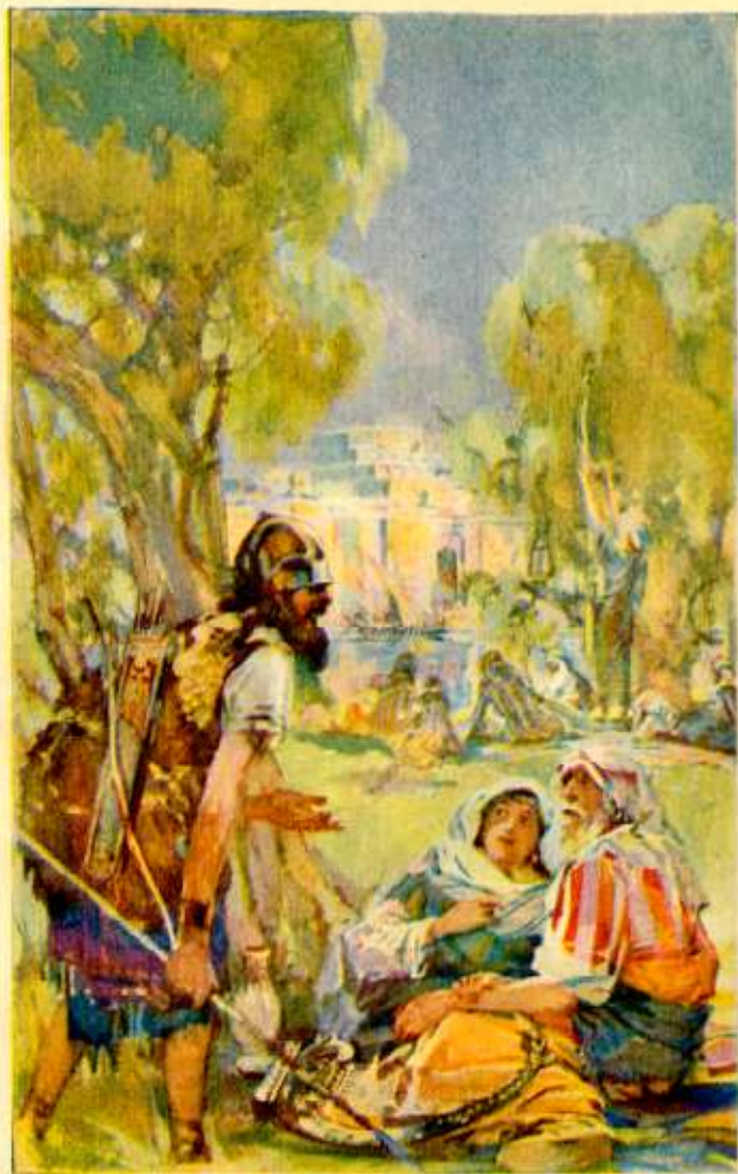
Jewish Captives Mourning in Babylon