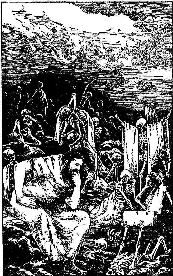
Valley of Dry Bones