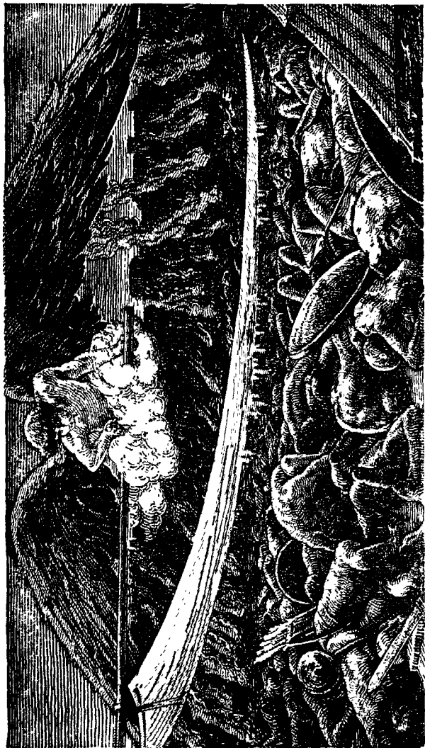
Jehovah Delivers Jerusalem from Assyria's Army