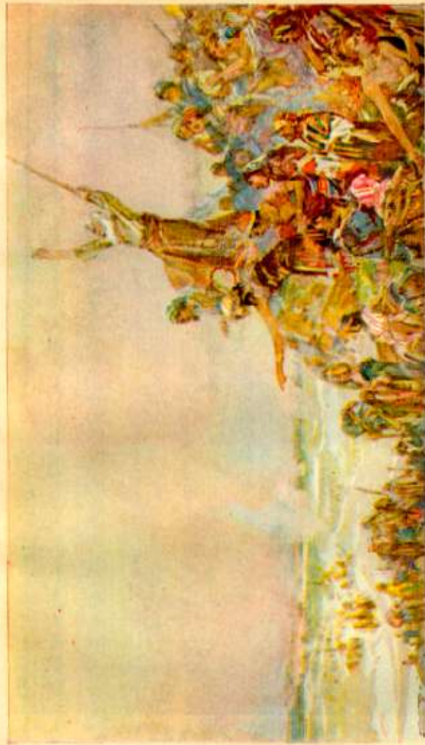
Israel's Deliverance at the Red Sea

Forebush shows the Coming Overthrow of Man's Oppressors