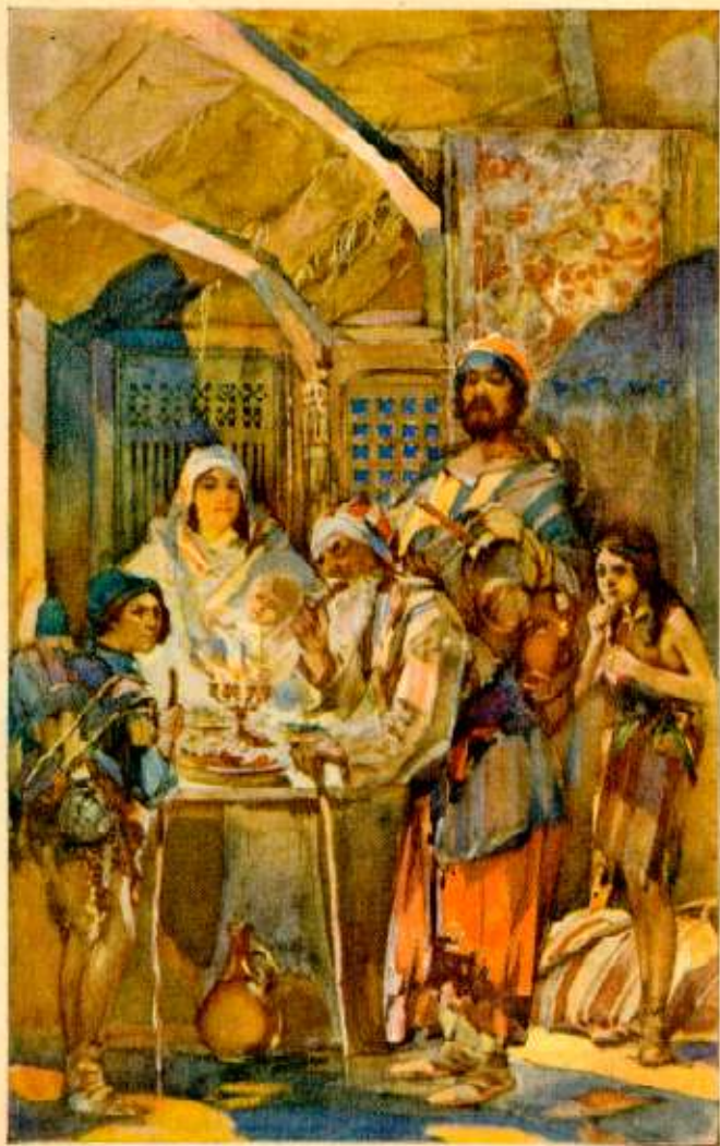
The Passover Feast