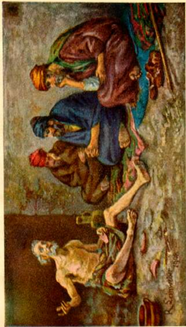
Job and Satan's Agents

Picturing Afflicted Humanity and Its False Religious Comforters