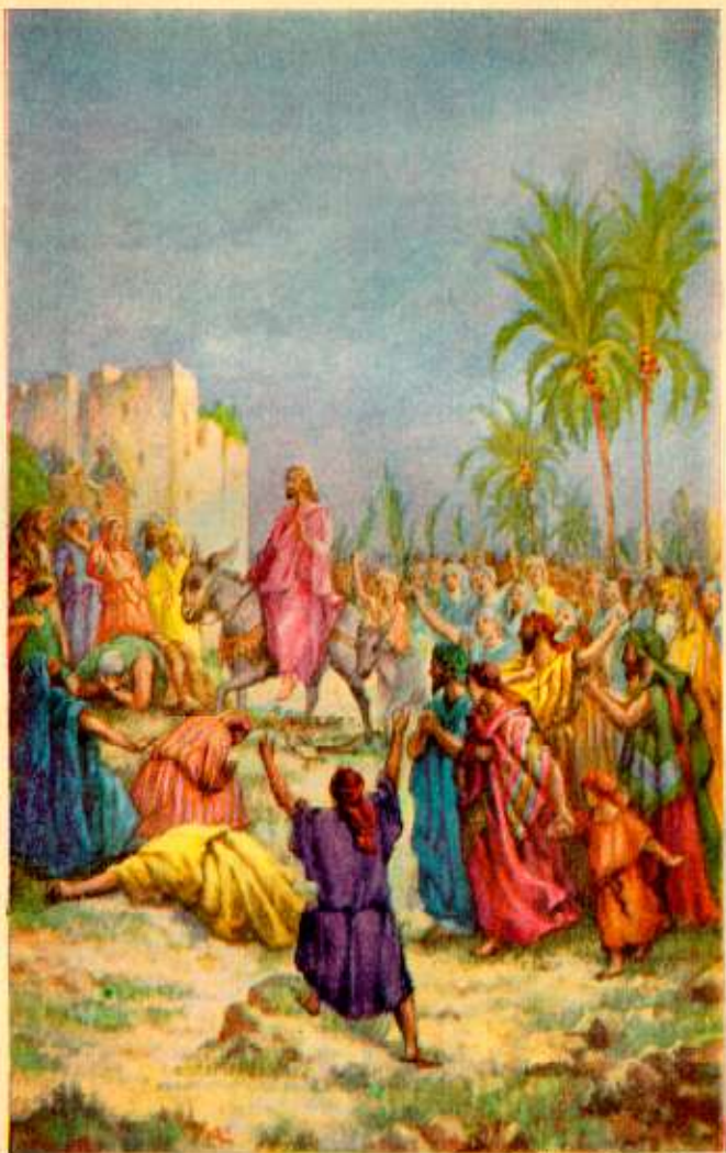
Hailing Earth's Rightful Ruler