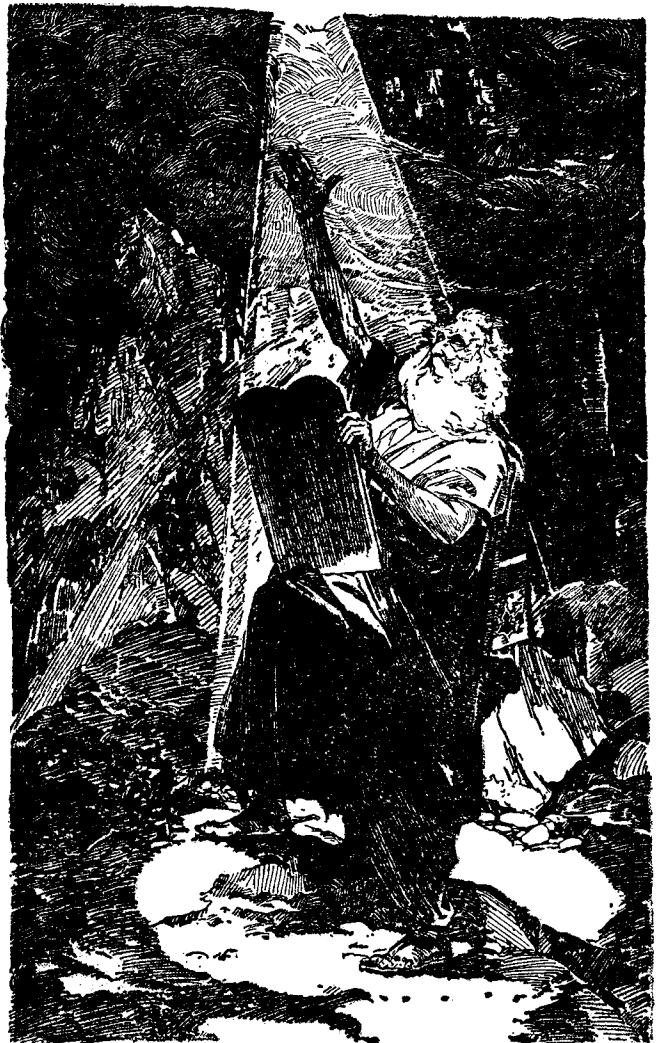
Moses Receives the Law at Mt. Sinai