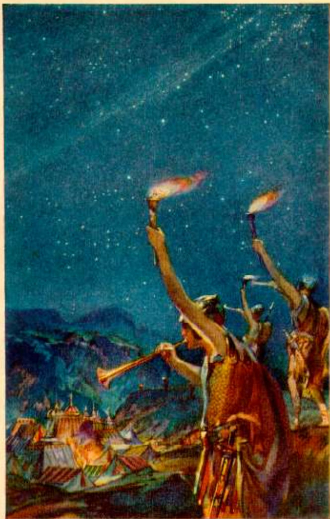
Jehovah Gives Gideon Victory over the Midianites Page 96