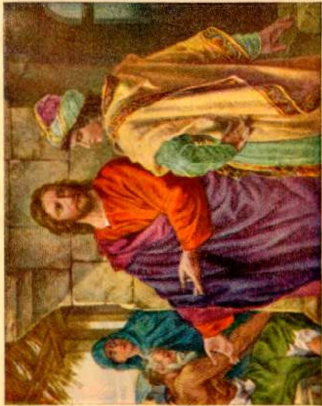
Christ and The Rich Young Ruler

Those words of the Master mean that the Christian must be completely and fully devoted to doing God's will. The Christian must be made perfect by following the right course of action, which course of action is marked out by God's Word. Pages 218, 255