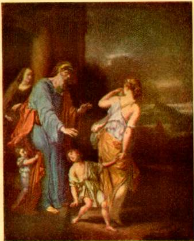
Hagar and Ishmael