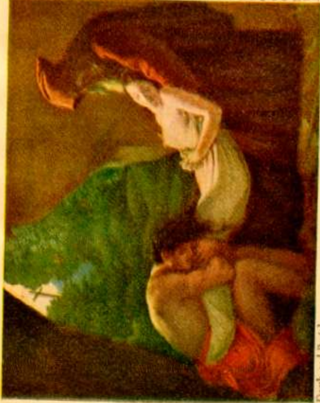
Death and Burial