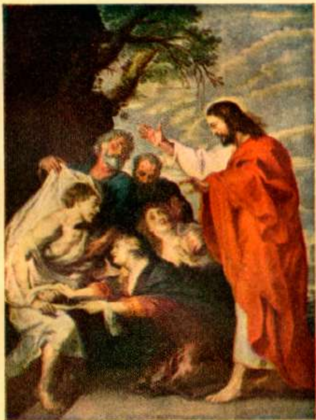
Awakening of Lazarus