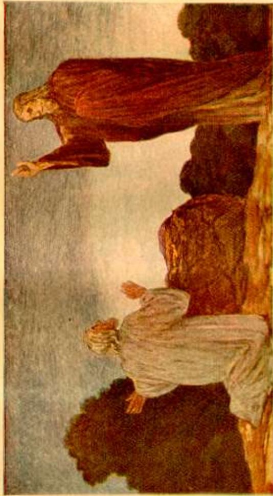
The Promise to Abraham

Jehovah directed Abraham to go into a strange land, God promised, . . . "In thee shall all families of the earth be blessed." (Gen. 12: 3) Here was an unconditional promise made by Jehovah to bless and therefore to reconcile all the families of the earth, Page 156.