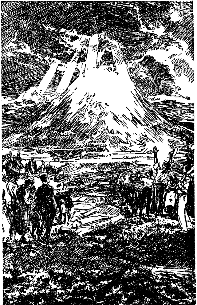
MORE TOLERABLE JUDGMENT FOR SODOM THAN FOR CHRISTENDOM (See Matt. 11: 24) Page 206