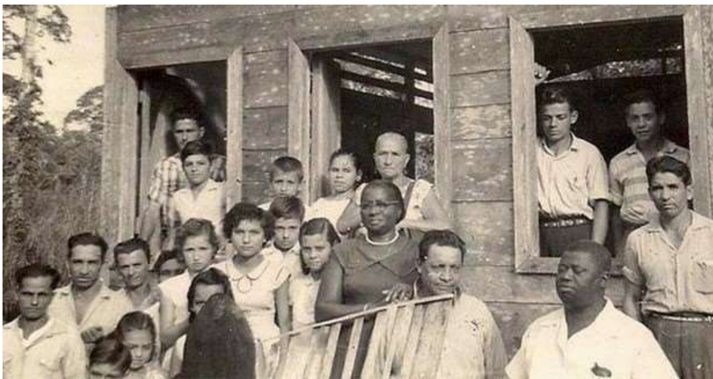
Meeting in Costa Rica, 1940