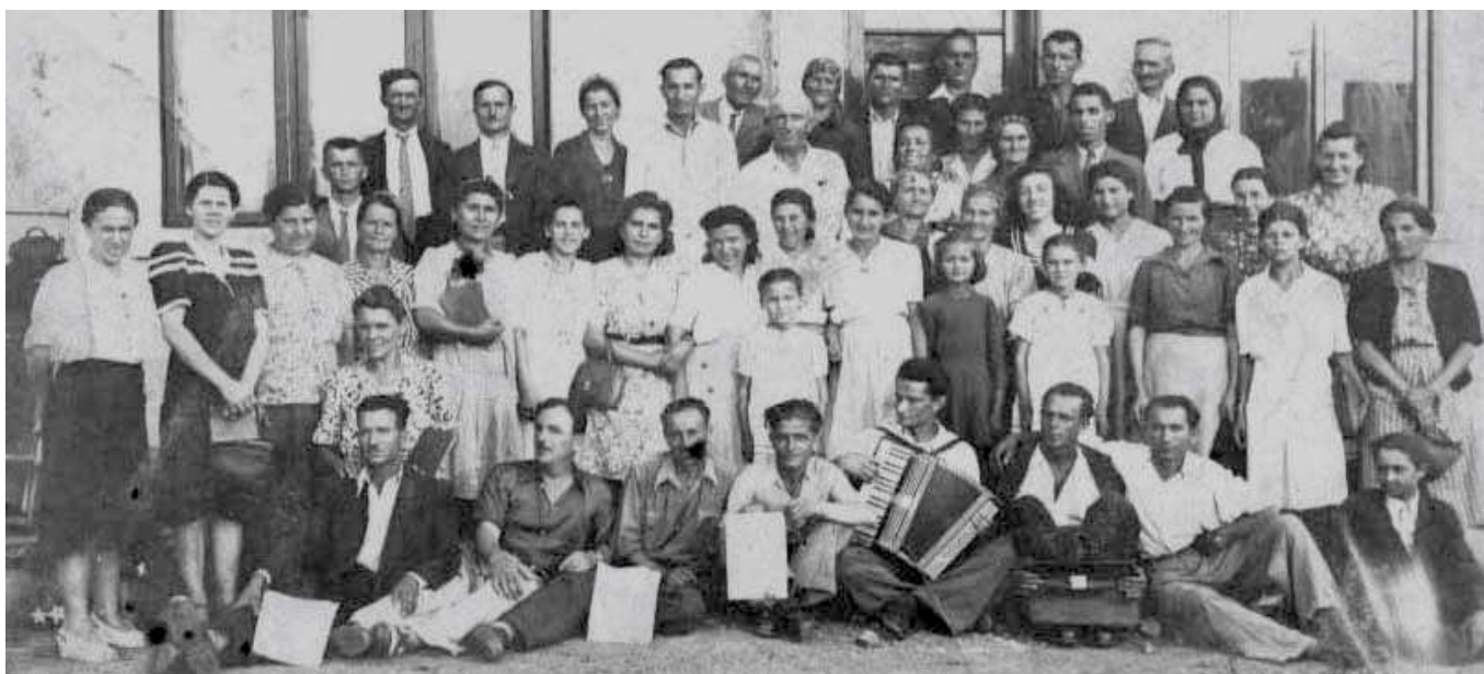
Meeting in Bucharest, Romania, 1947