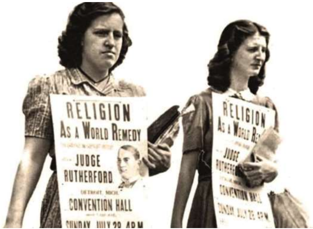
Preaching with banners, 1930s