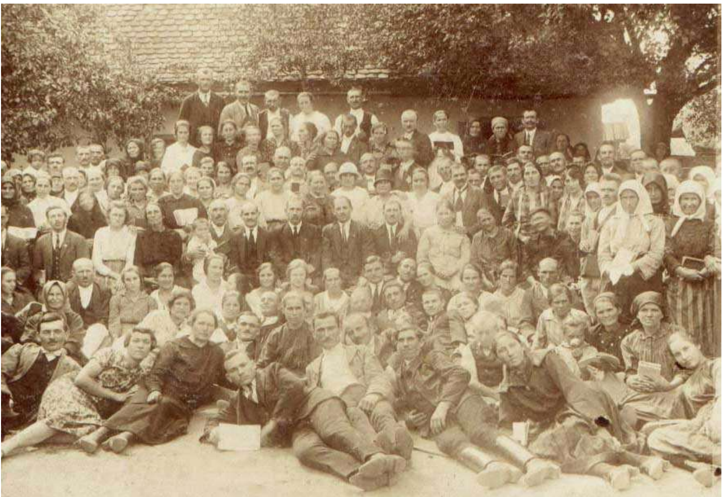
Convention in Romania, Veluren, 1926.