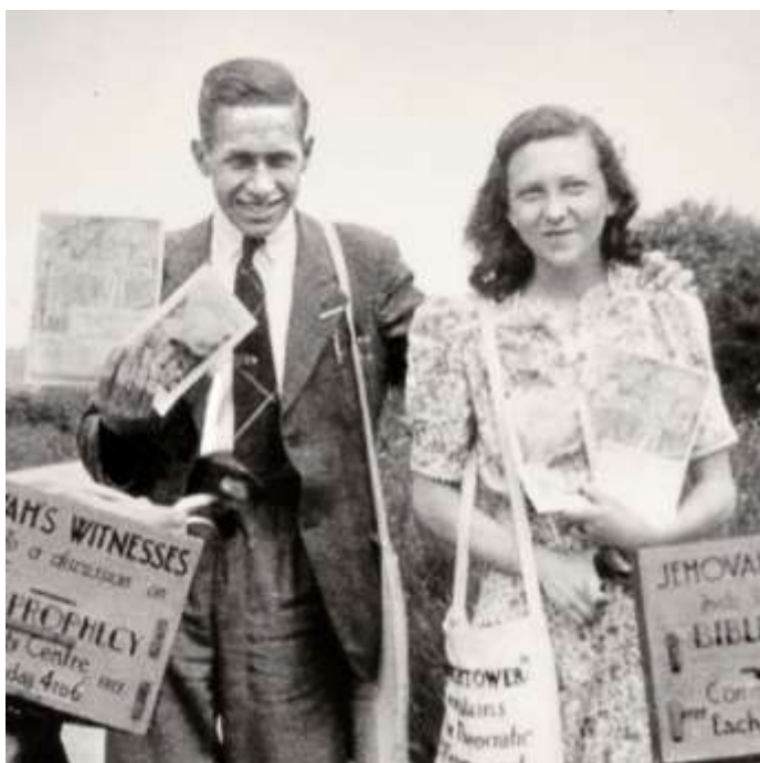
Pioneers in Britain, 1940s