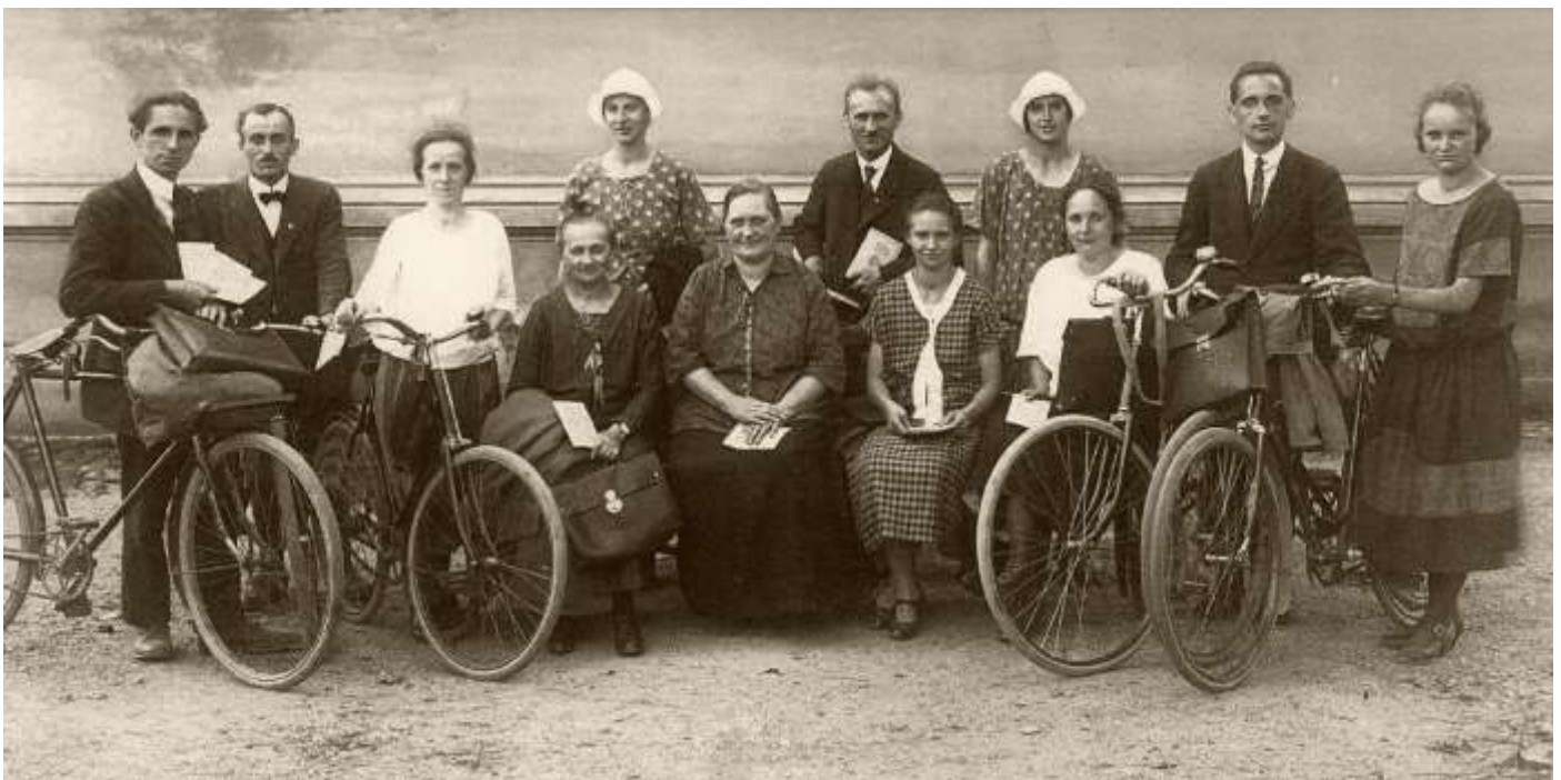
Missionary work in Germany, 1920s