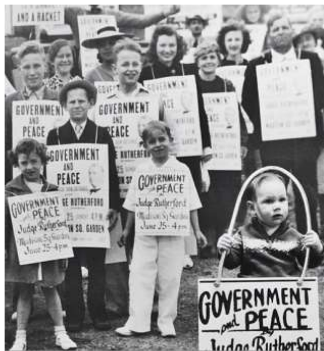
Preaching with banners, 1930s