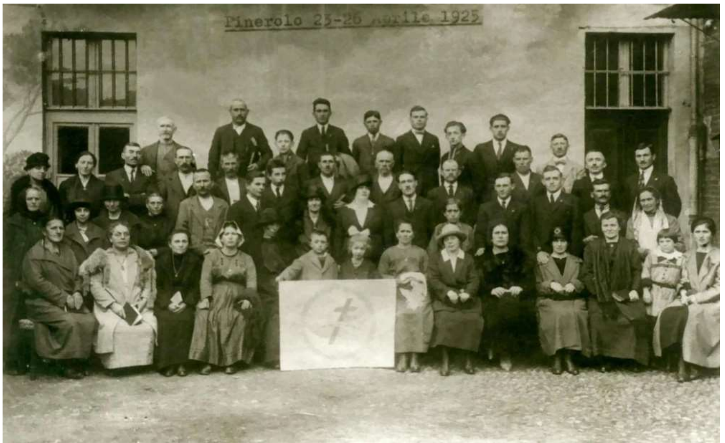
The Bible Students Convention in Italy, 1925