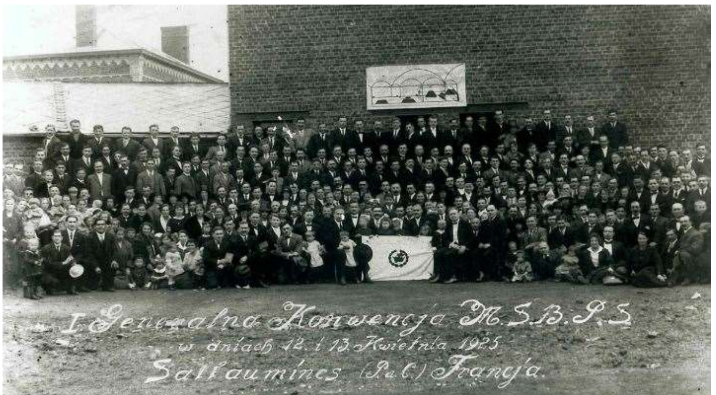
The Bible Students Convention in France, 1925