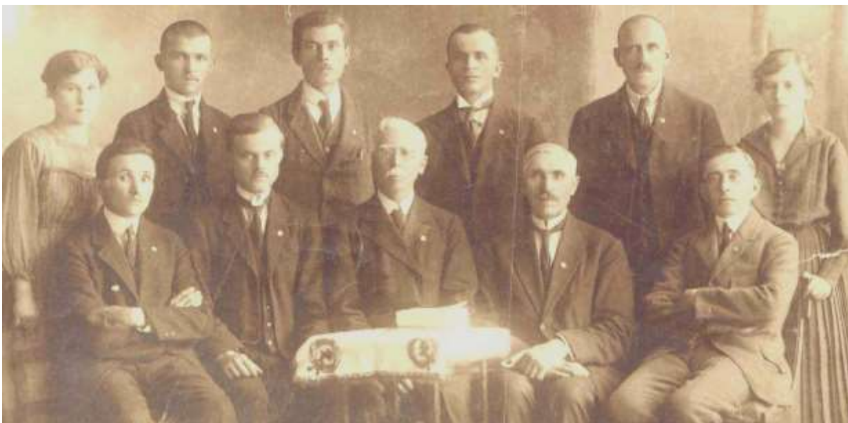
Pioneers in Romania, 1920s.

From these explanations, we could understand that in the days of the Bible Students, the brothers attended meetings with uncovered heads, while sisters, for the most part, covered their heads for the reasons mentioned above. However, even at that time, this issue was not approached fanatically and was not considered a vital, divine commandment, as we read above. This is also confirmed by photographs from meetings, missionary activities, and literature work of those times: