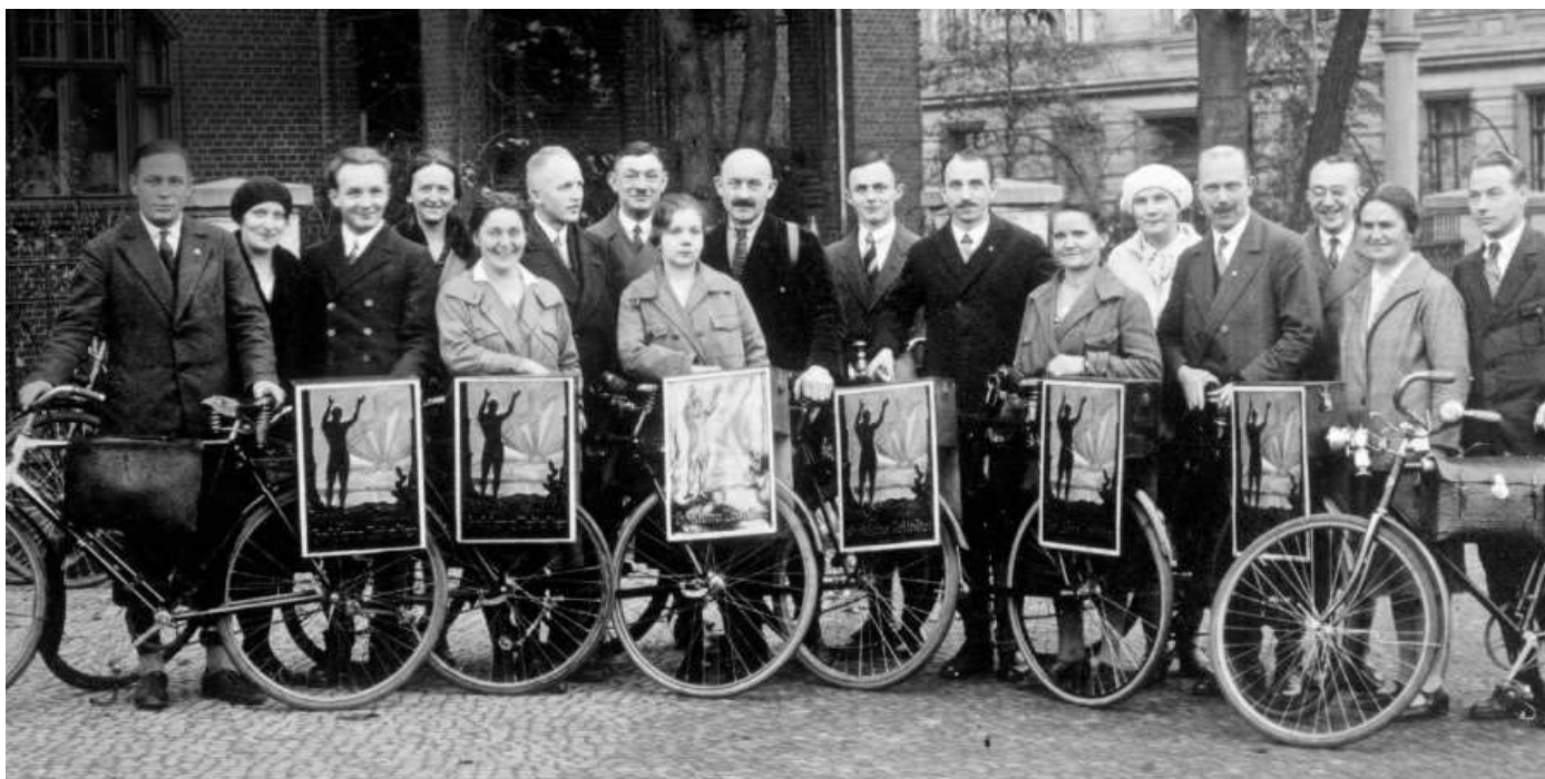
Preaching activities in Germany, 1930s