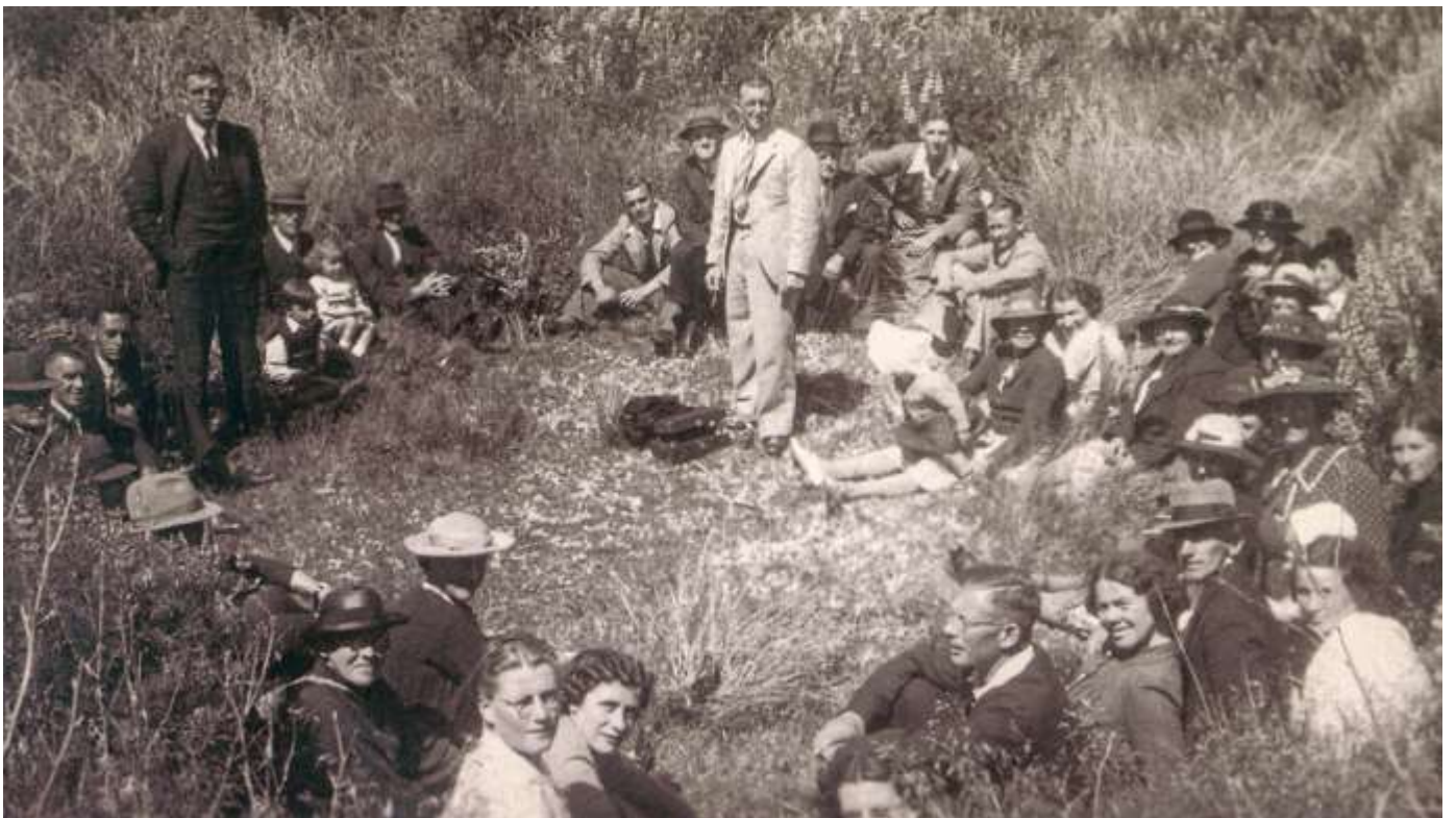
Underground meeting after the ban of the organization in New Zealand, 1940s