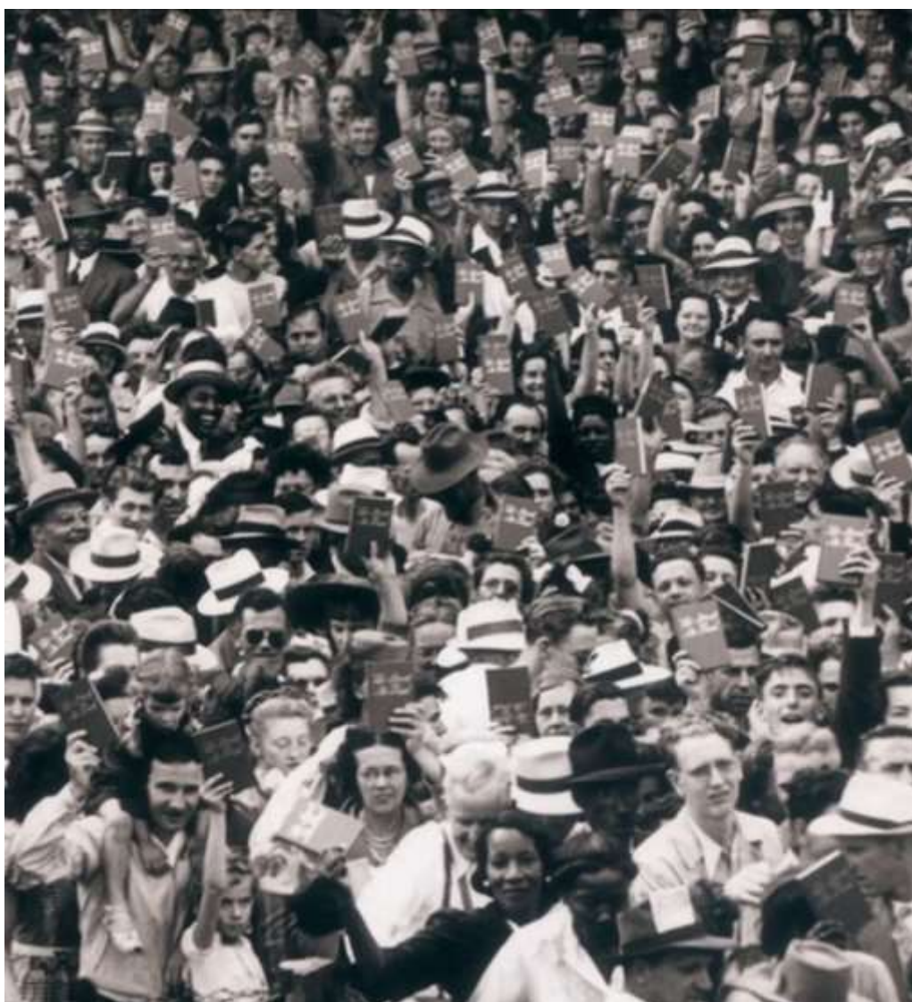
Convention in Cleveland, Ohio, 1946 ( The participants of the congress received the book "Let God Be True" )