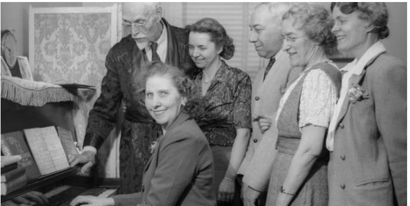
Singing songs, 1940s