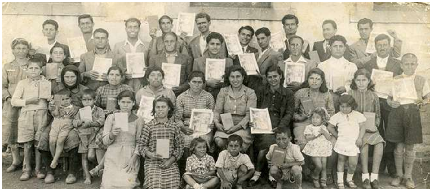
Meeting in Cyprus, 1940