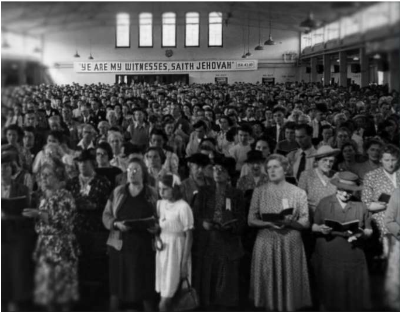
Singing songs together at a convention in the 1930s and 1940s.