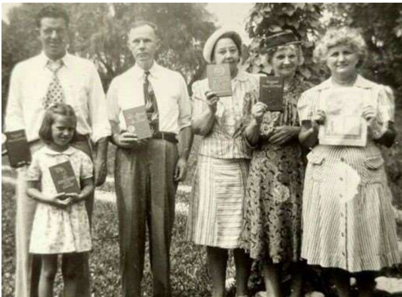
Preaching with Books and Magazines 1940s