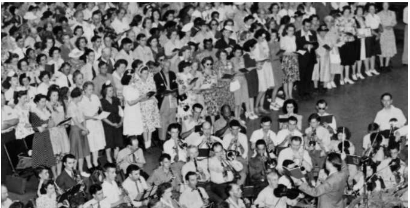
Singing songs together at a convention in Buffalo, 1946