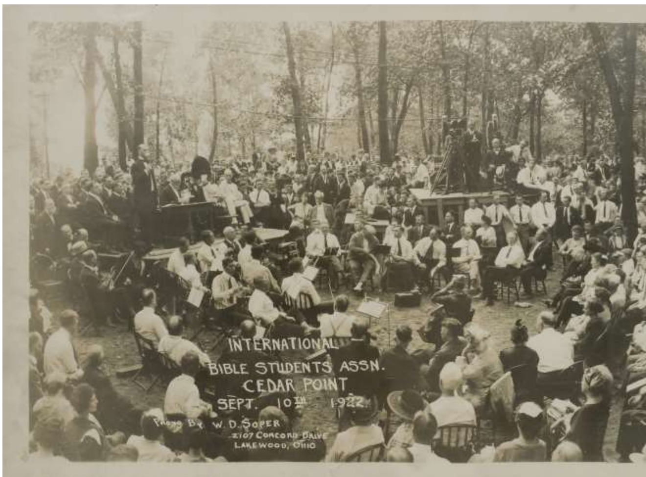
The Bible Students Convention in the United States, 1922