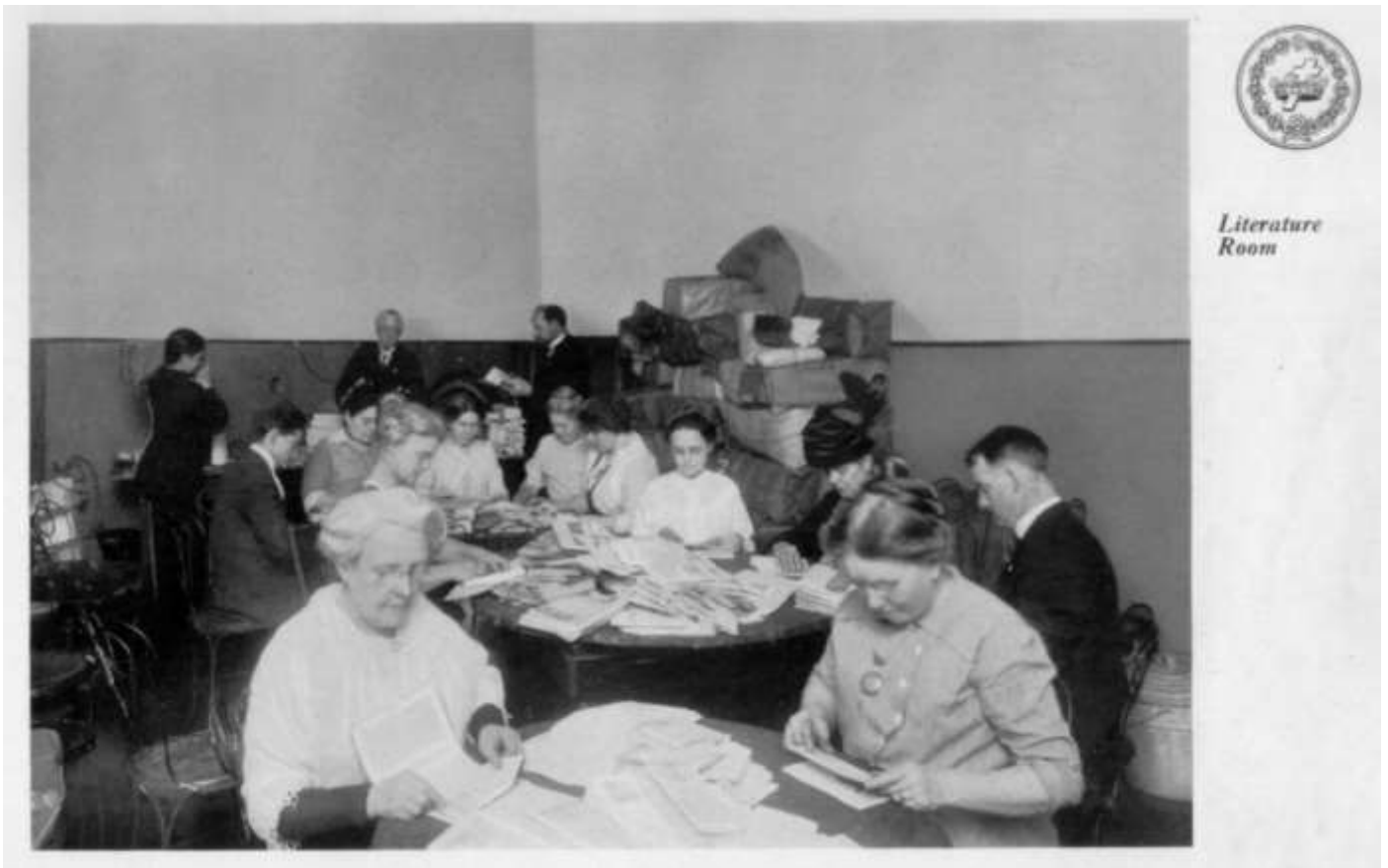
Literary room, 1914