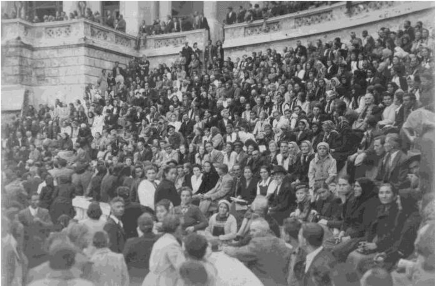
Convention in Romania, Bucharest, 1946