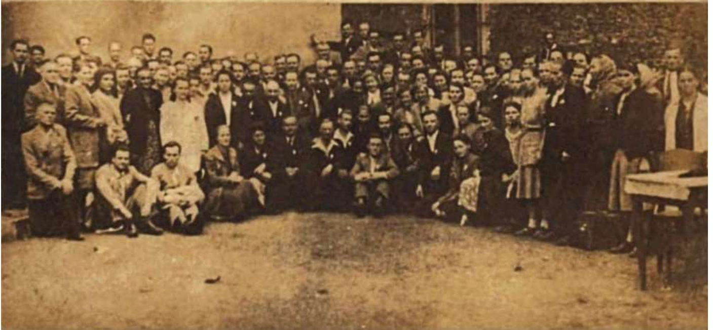
Convention in Poland, 1947

"Świadkowie Jehowy", którzy przeżyli niemieckie Obozy Koncentracyjne. Fot. na Konwencji w Krakowie 25 i 26.5.1947 r.