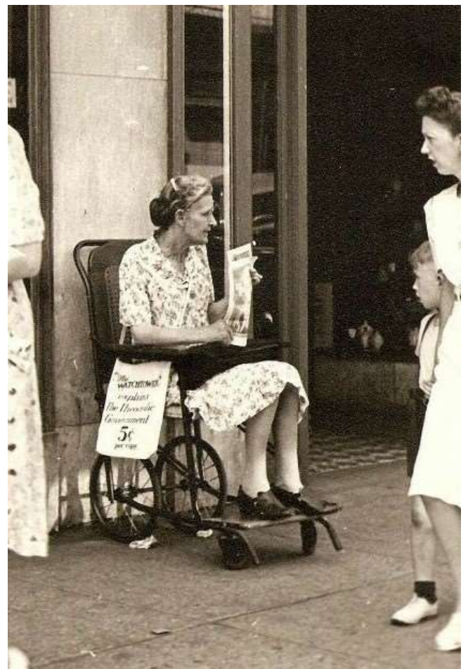
Preaching with Magazines 1940s