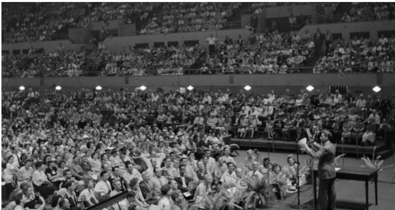
Convention in Buffalo, 1944