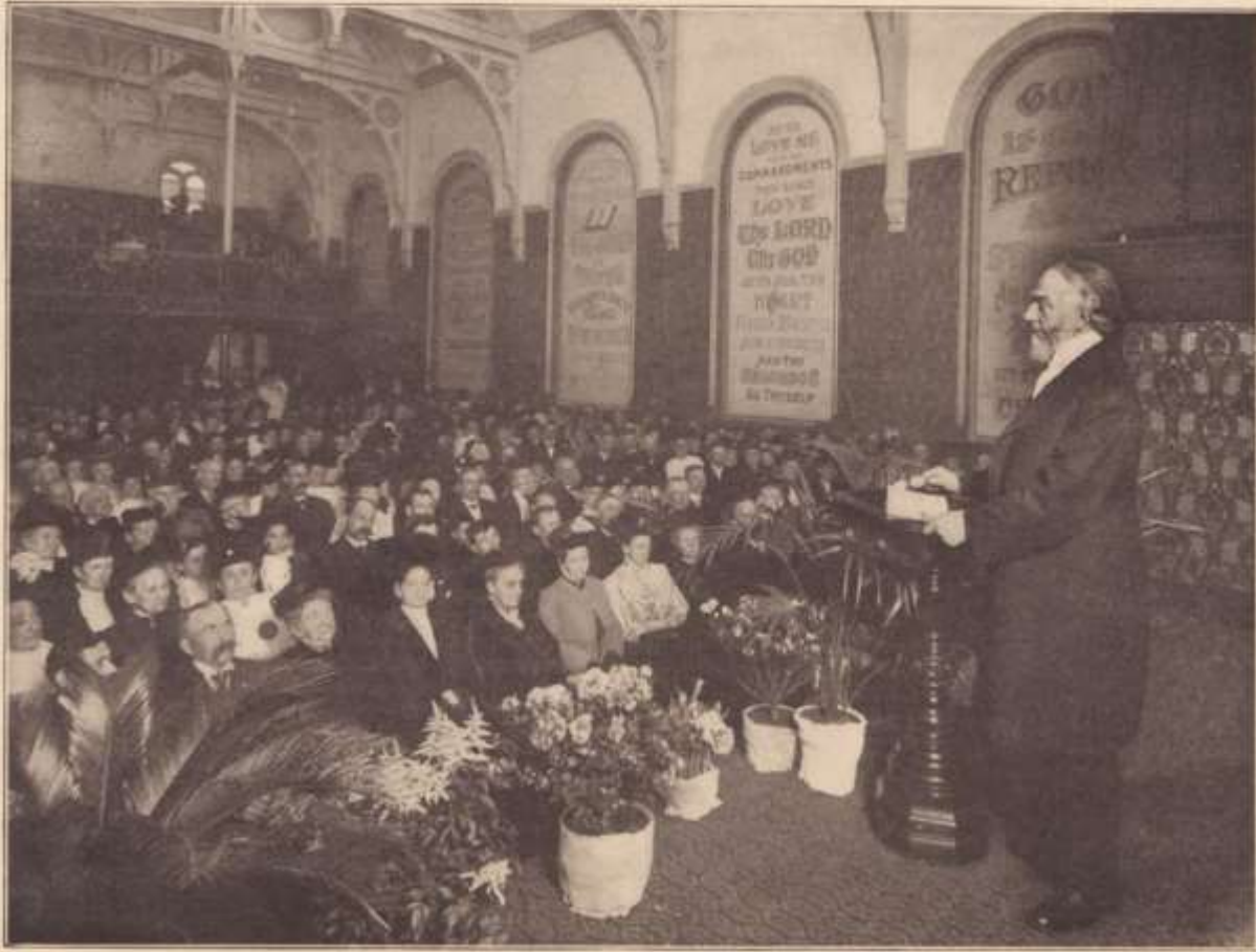
The Bible Students Convention in the United States, 1909