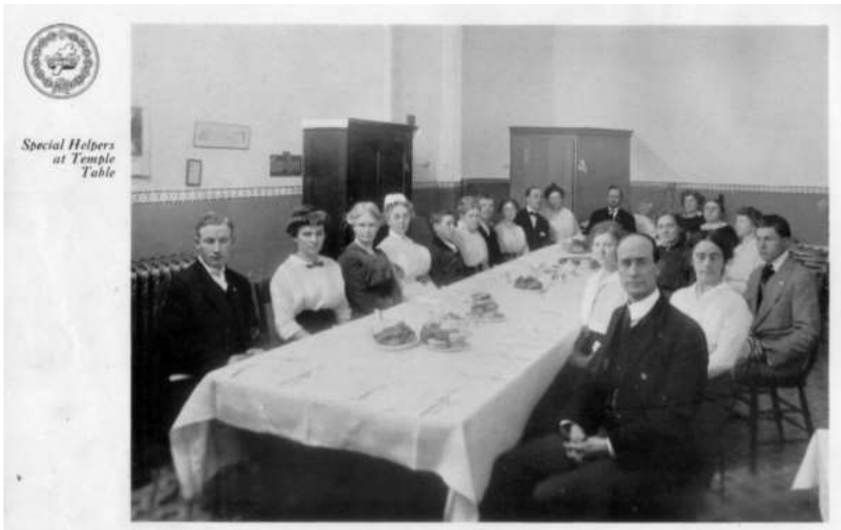
Special assistants at the temple table, 1914