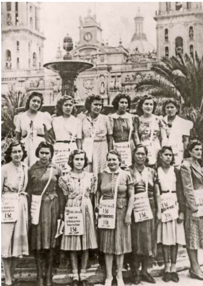
Preaching with magazines in Mexico, 1945