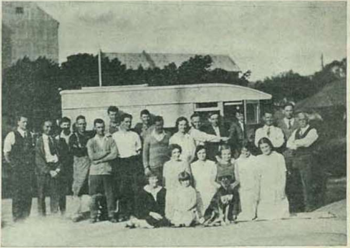
The Bethel Family at Sydney, Australia, Saying Goodbye to Two Pioneers Setting Out Across the Continent.