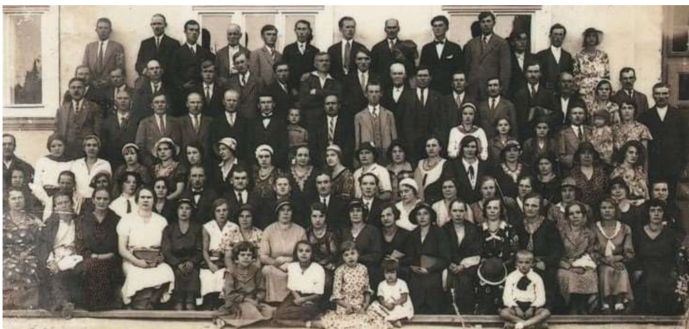
Convention in Borislav, 1932

Let's summarize. According to theocratic teaching based on the Holy Scriptures, from 1926 up until 1950, we can identify the following situations in which dedicated women, regardless of their marital status, (whether married or not) are required to cover their heads :